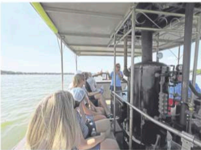
Passengers ride a steamboat on Cedar Lake.

When I heard that the Museum at Lassen's Resort was starting weekly steamboat tours on Cedar Lake, I knew I'd have to get out there this summer for a tour. I ended up on the second ride of the season. The Cedar Lake Historical Association is offering 20-minute and 45-minute narrated excursions on the lake